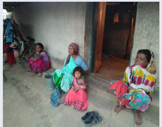
Corona Awareness In Tribal Areas