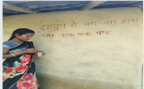
Corona Awareness In Tribal Areas