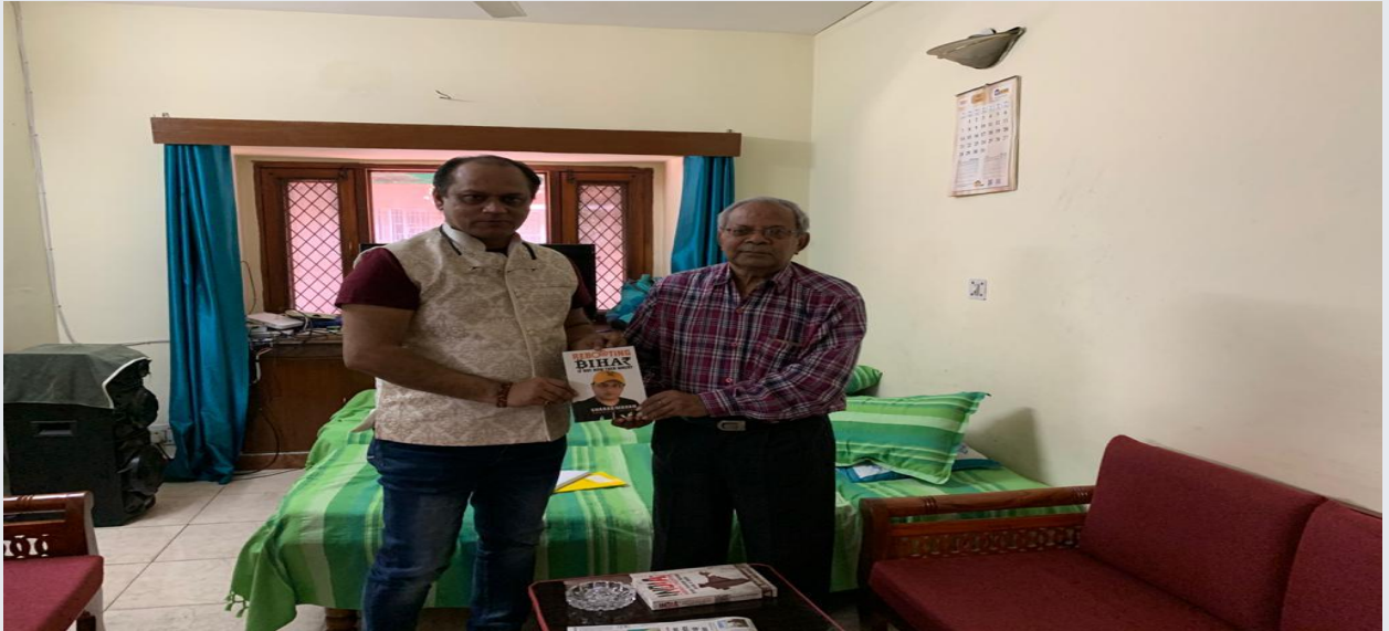
Meeting with International Writer Shri Sharad Mohan, USA on Rebooting Bihar