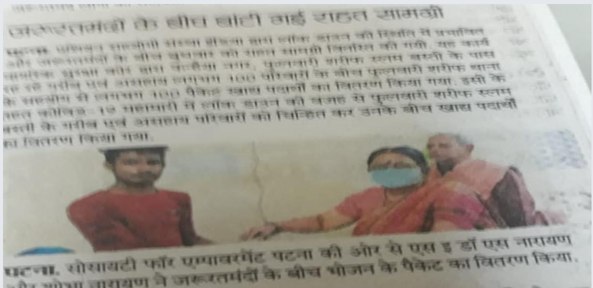
Distribution of Relief Material During Pandemic