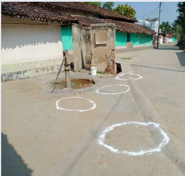
Social Distancing: Kunkuri Block Jashpur