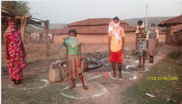
Maintaining Social Distance