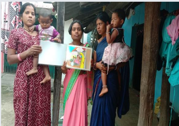
Corona Awareness In Tribal Areas