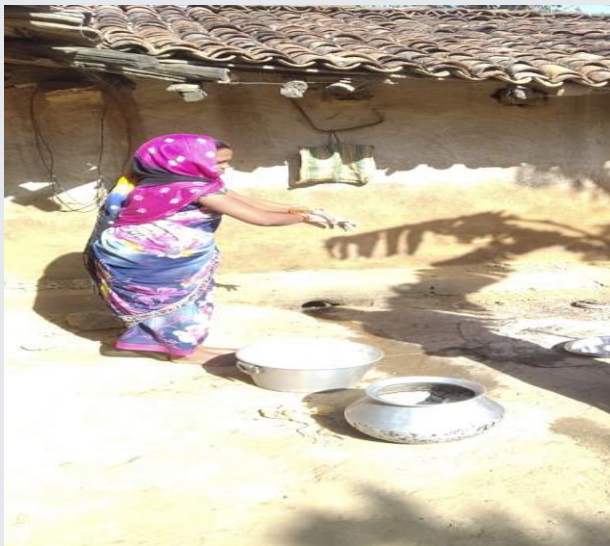
Maintaining Hygiene : Washing Hand