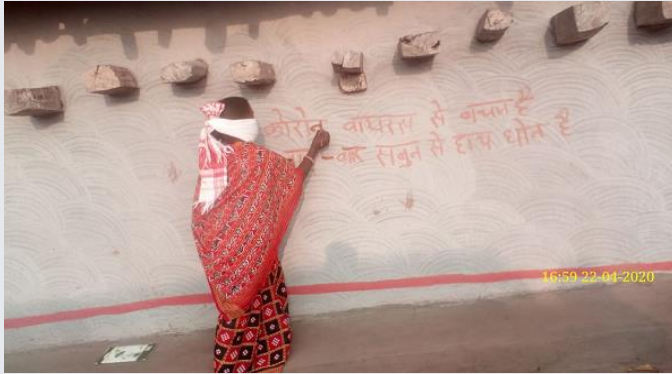
Corona Awareness In Tribal Areas