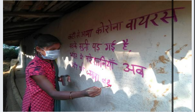
Corona Awareness In Tribal Areas